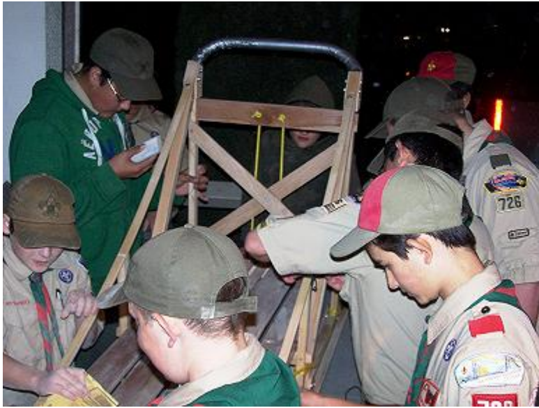
Working on the sled during Troop Meeting